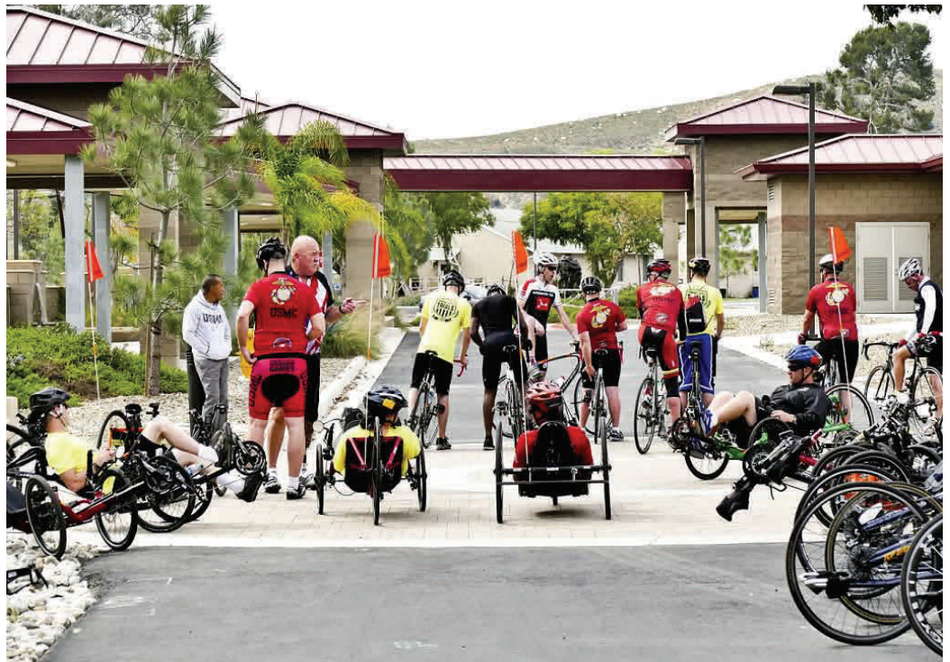
Cycling competitors at the Marine Corps. Trials, Camp Pendleton March 6, 2016