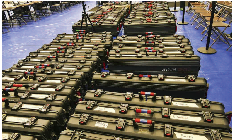
At shooting range