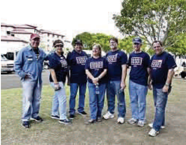
Our intrepid volunteers!